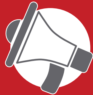
Design custom campaigns

And, SmartBanker integrates with leading CRM software to help you execute marketing and sales programs and to enhance results reporting.