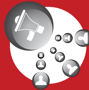
Create marketing lists